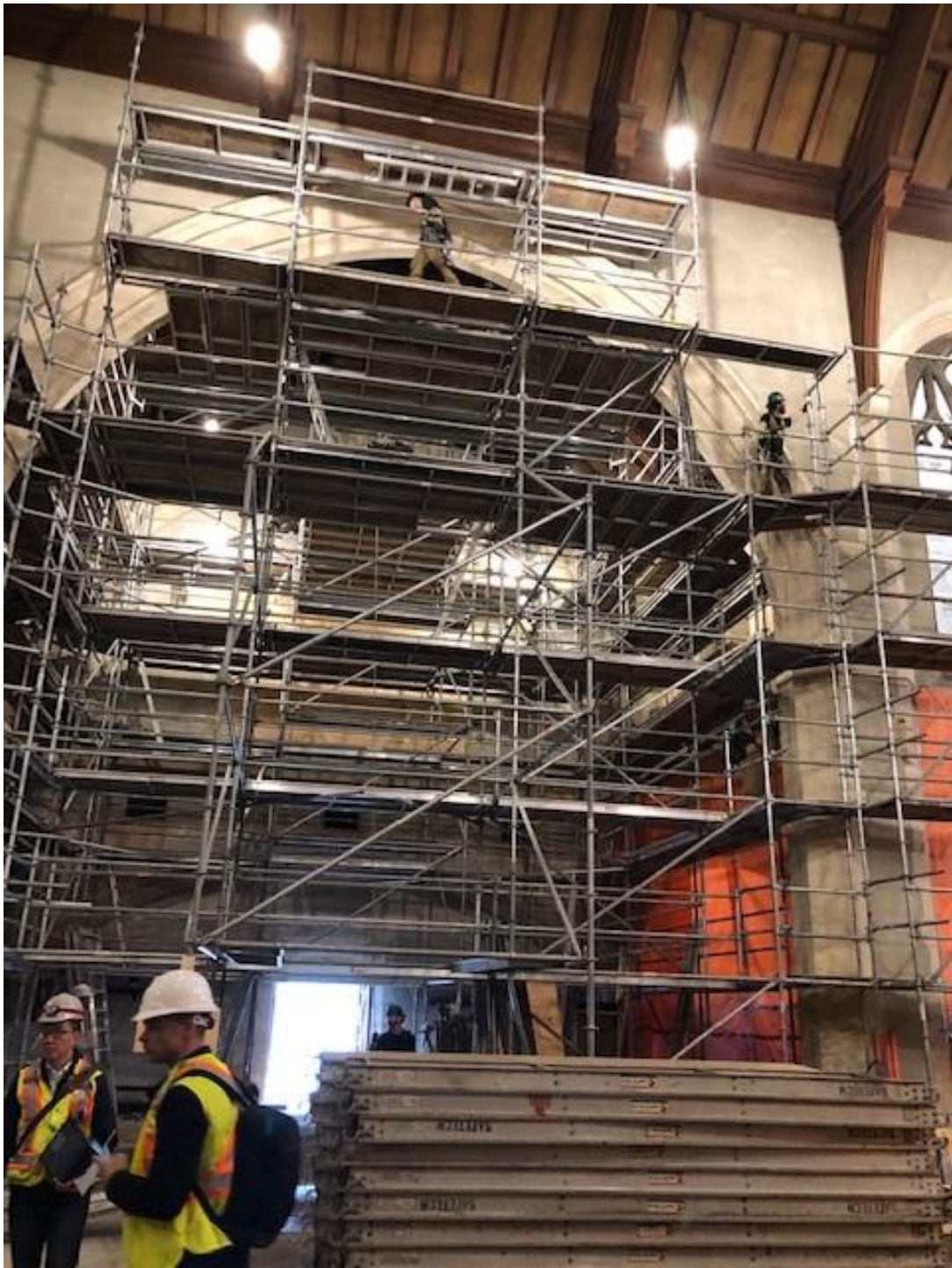
scaffolding to the ceiling