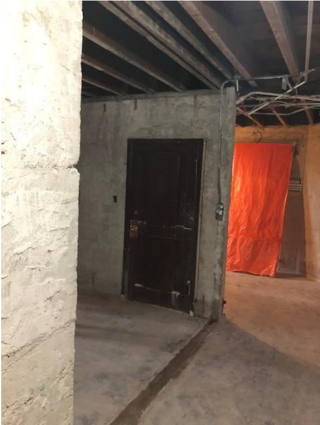
Marnie's Room minus the terracotta wall