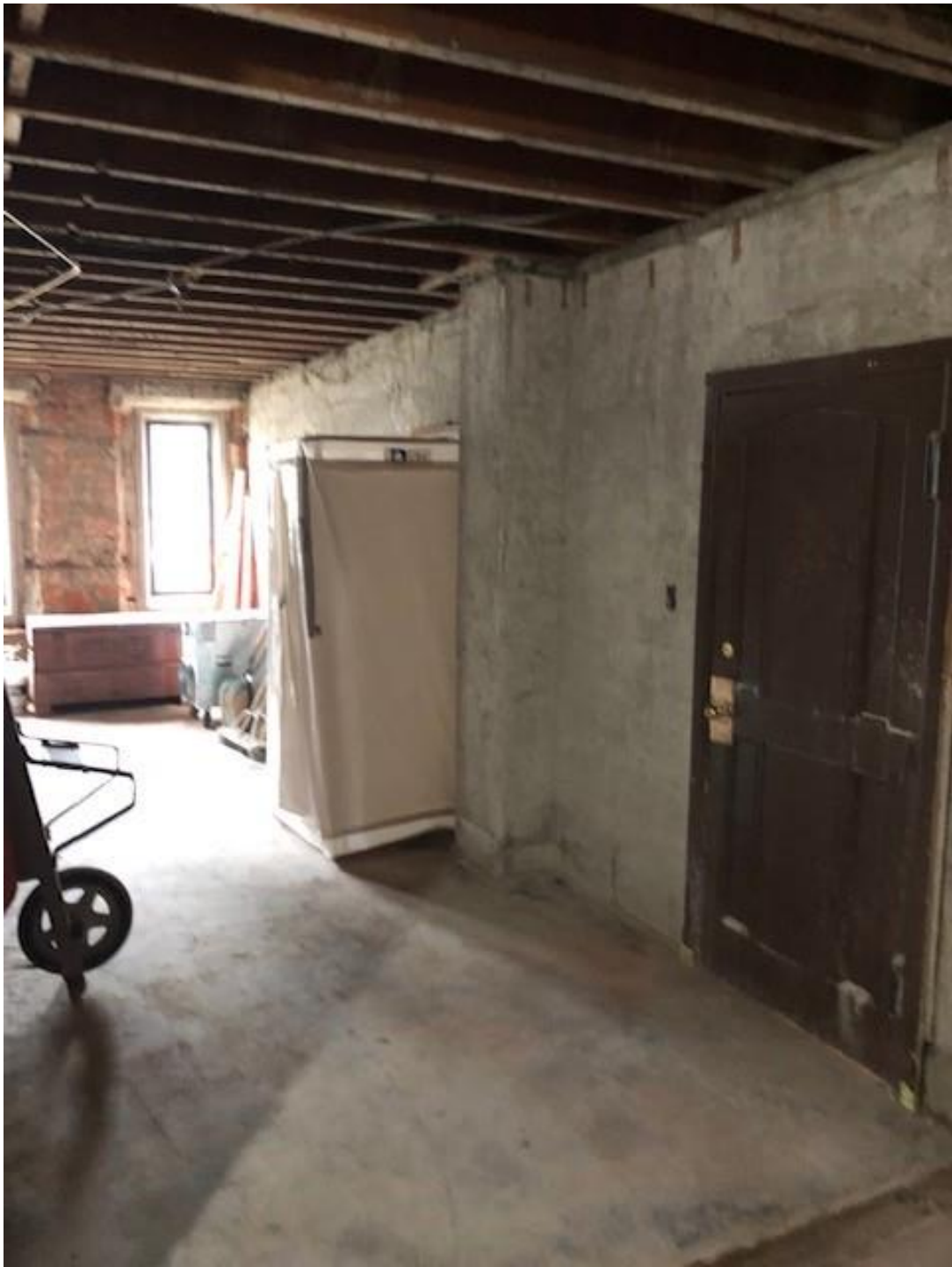
1Inside Marnie's Room