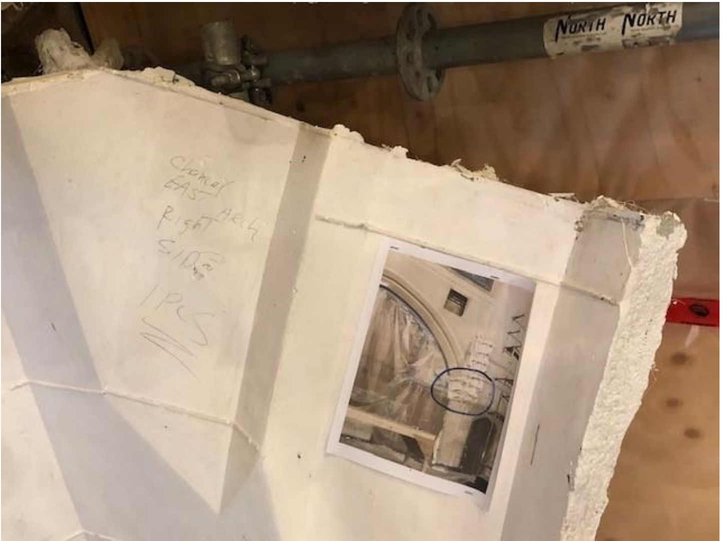
How they know where each mould is from