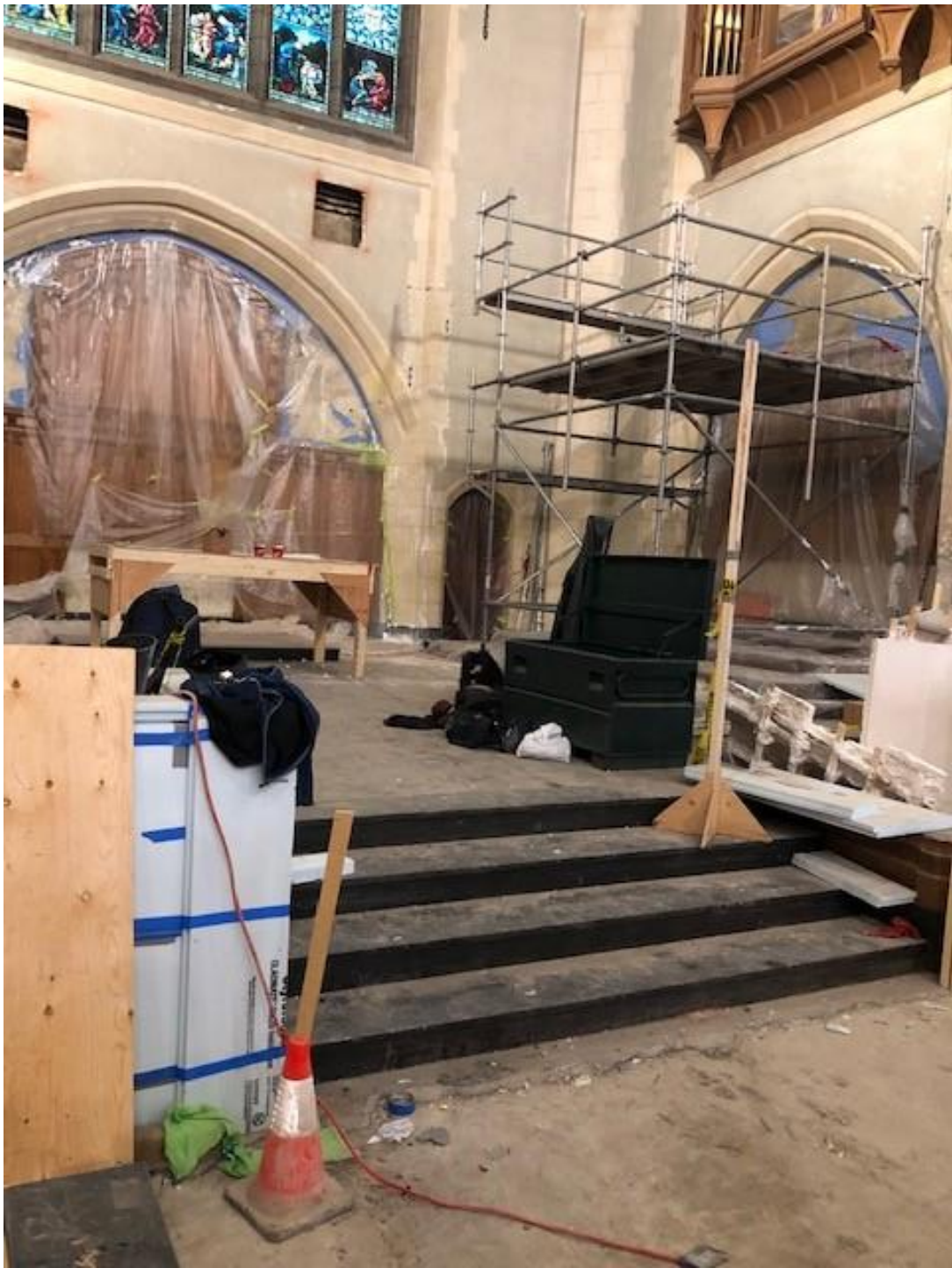
Chancel with wood protected