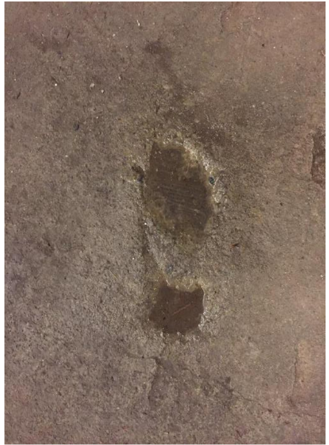
Footprints in the cement from 1933