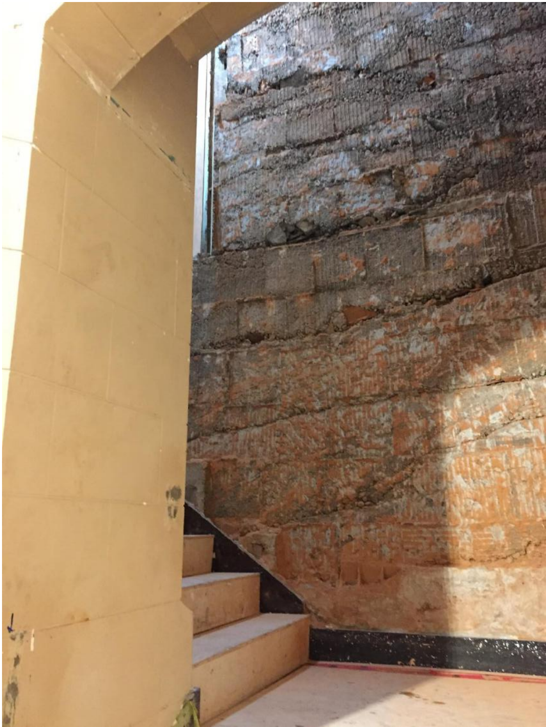
Up to the balcony