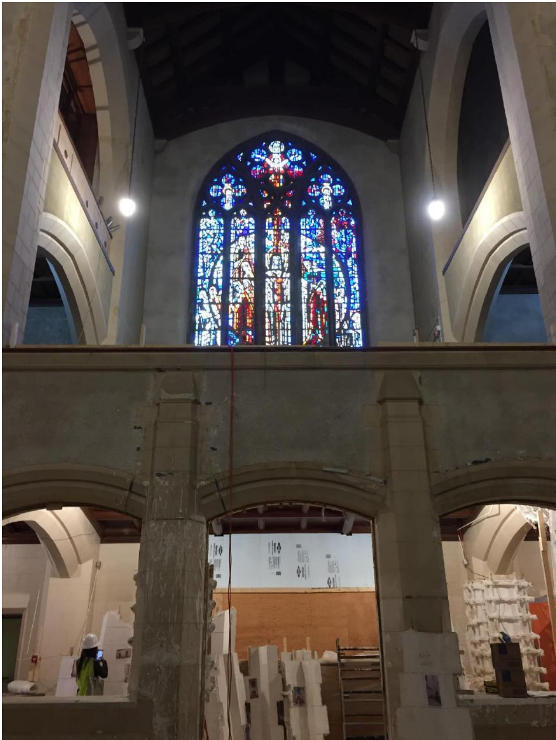
The back of the sanctuary