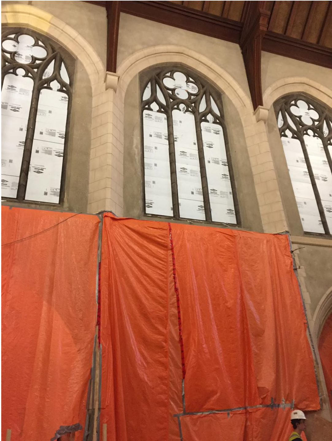
Stained glass windows boarded up