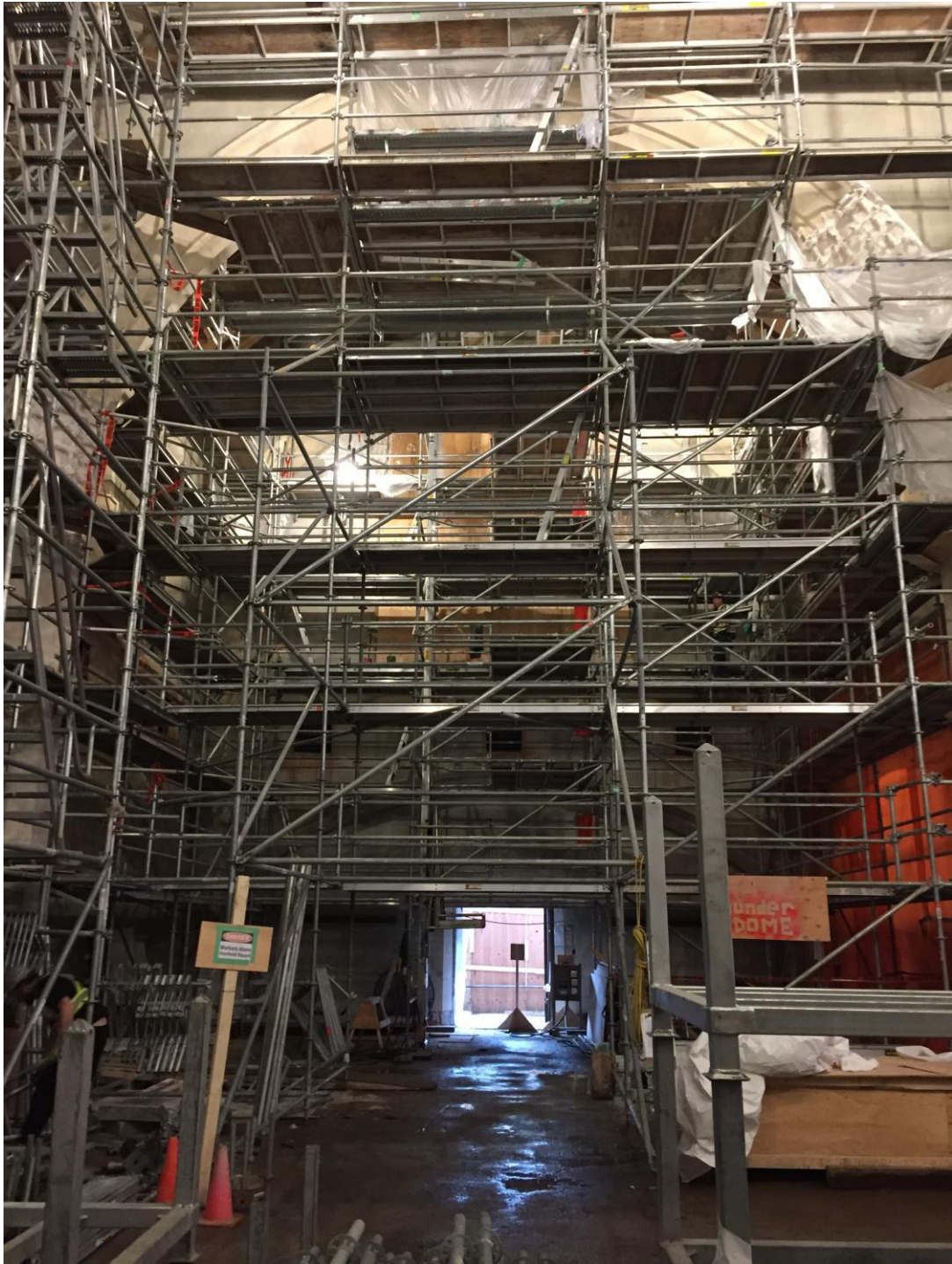
Looking toward Nelson St. And the North Transcept