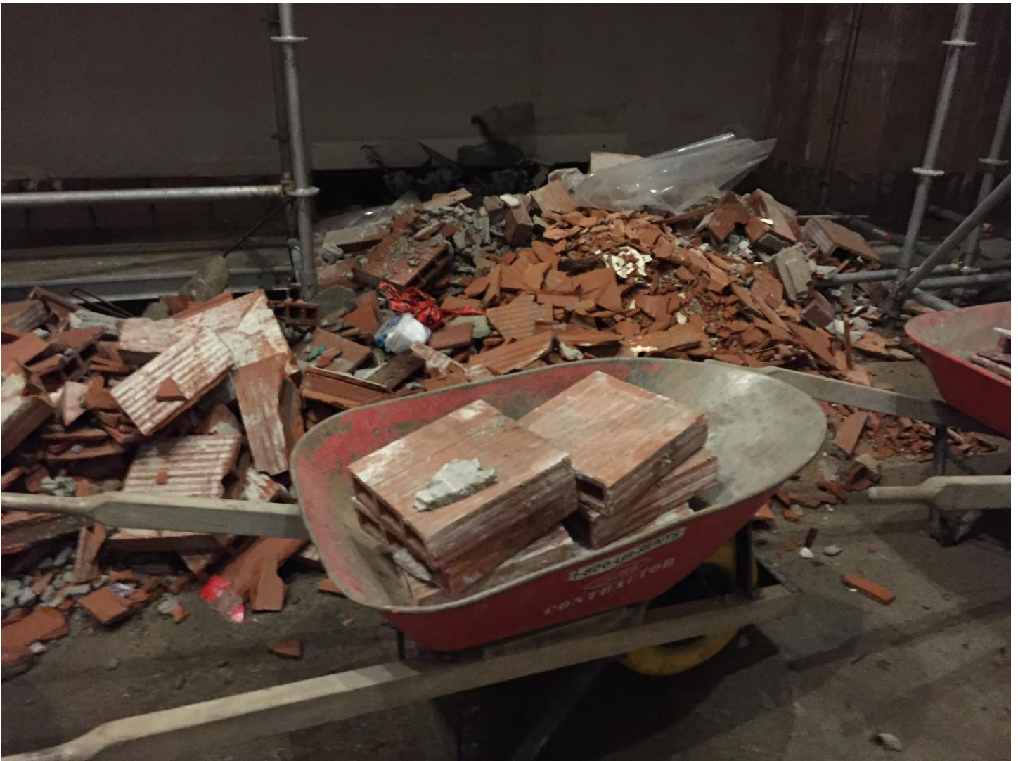
Terra cotta tile from behind the plaster walls