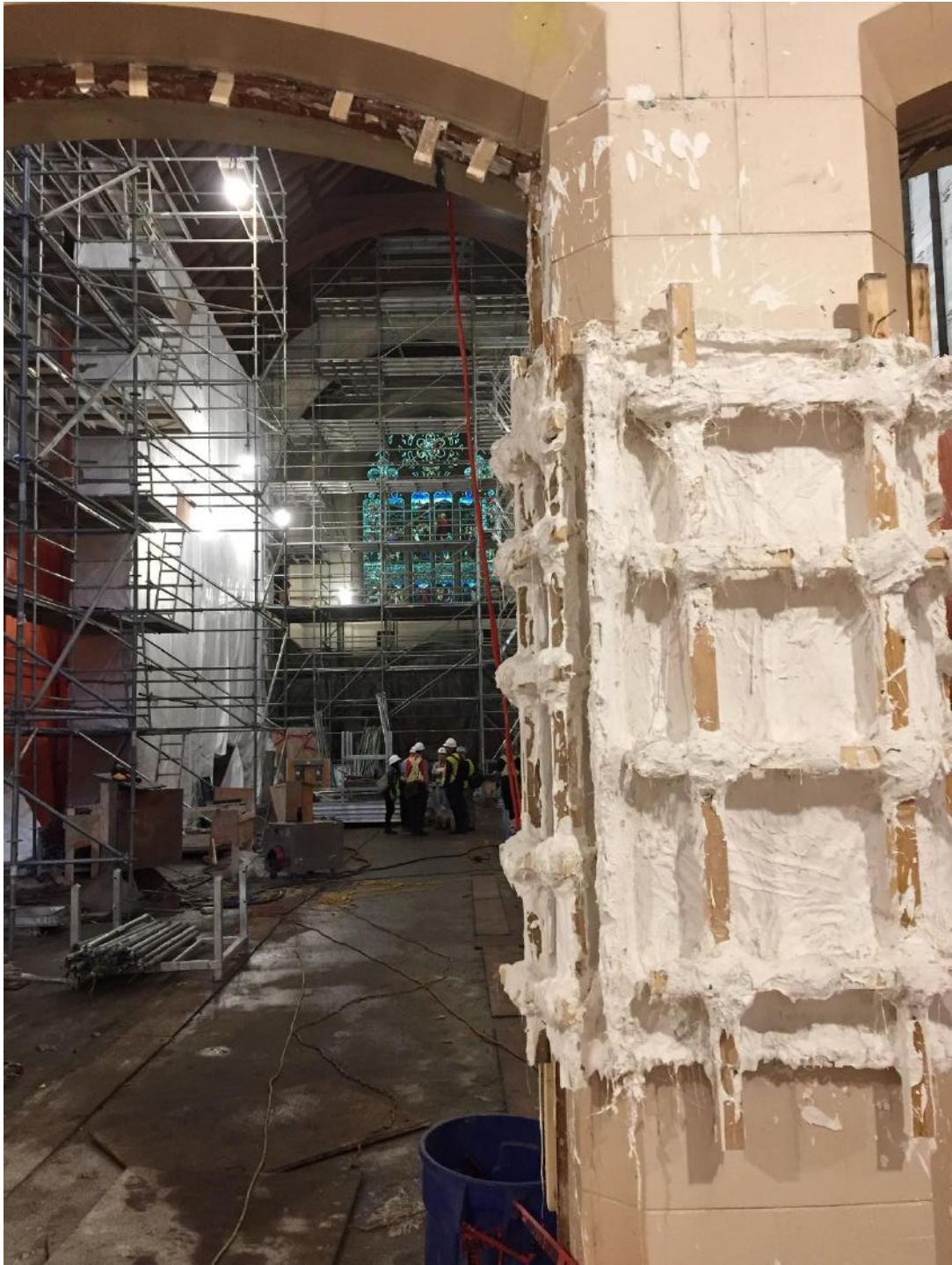
Plaster moulding in the Narthex 2