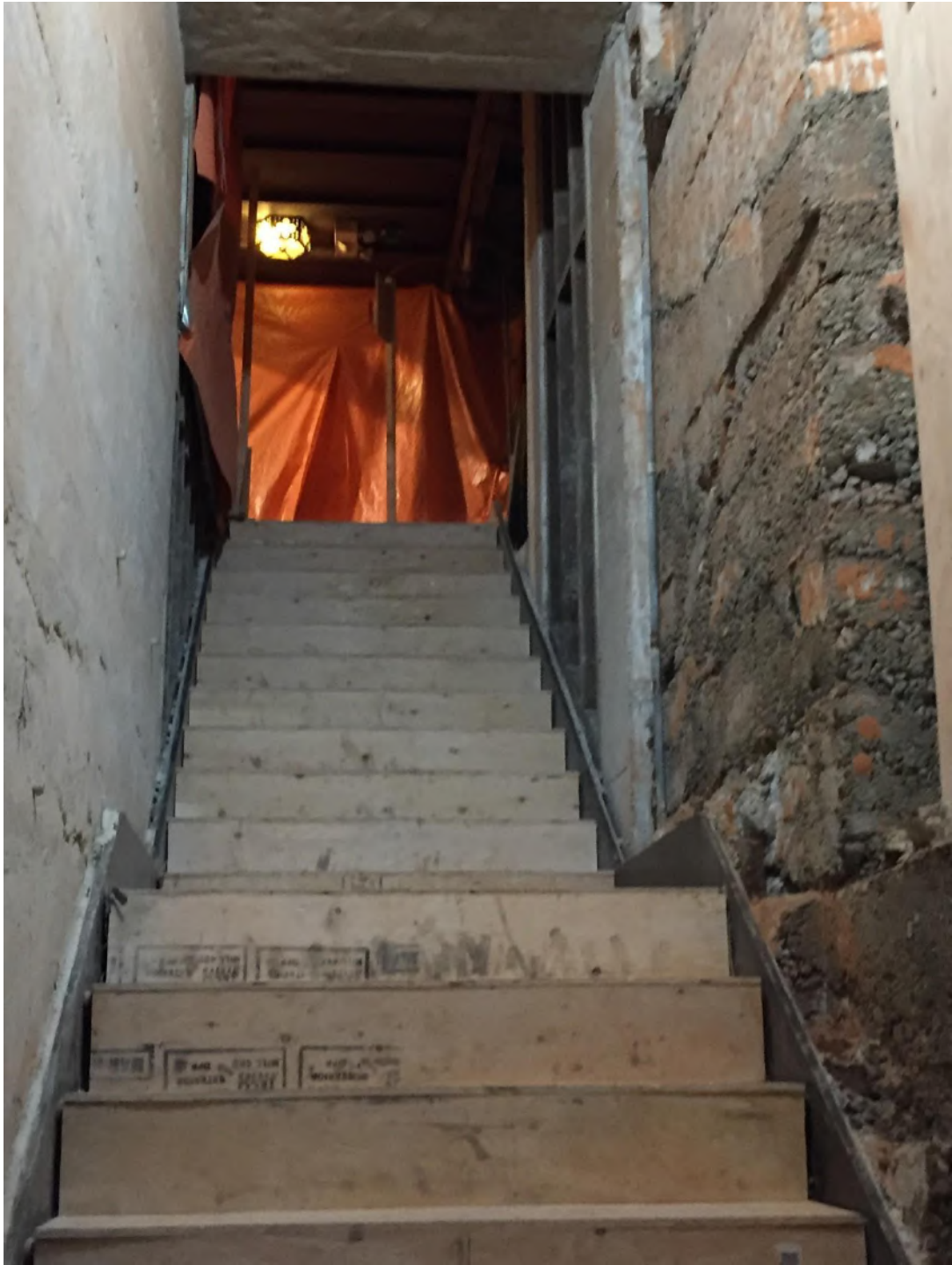
Up to the balcony 2