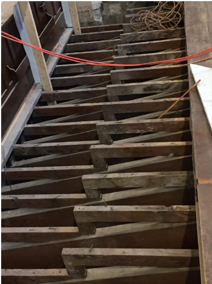
1Under the balcony floor