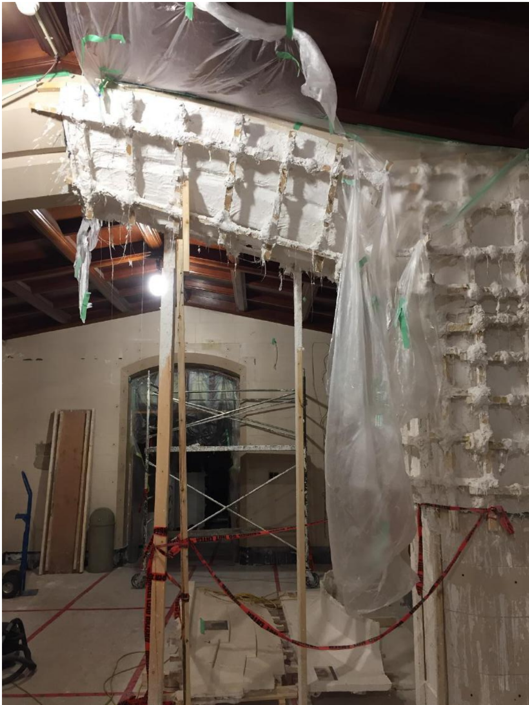
Plaster moulding in the Narthex