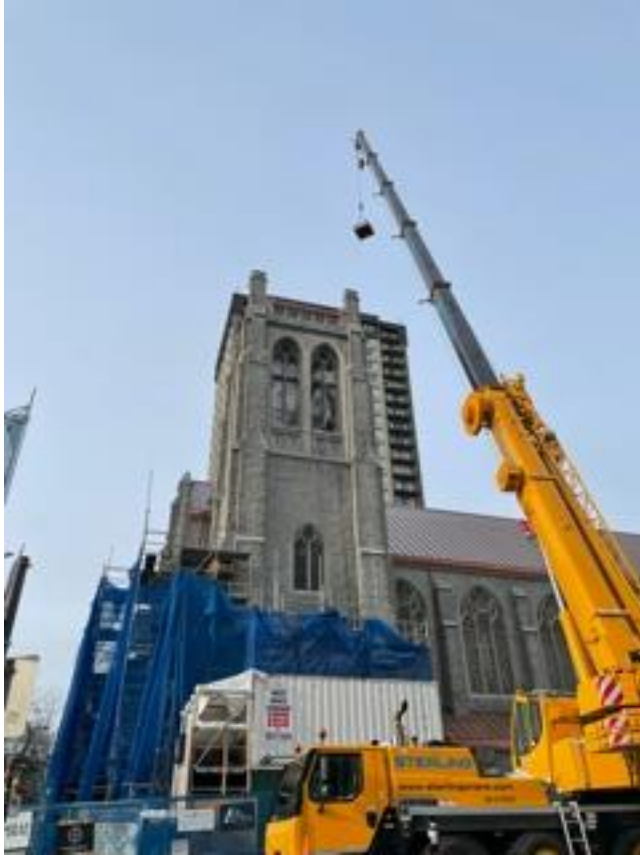
Picture 3 - putting the tools needed to secure the steel frame into the workers in the bell tower.