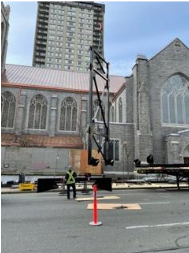
Picture 6 they are starting the lift up to the top of the bell tower